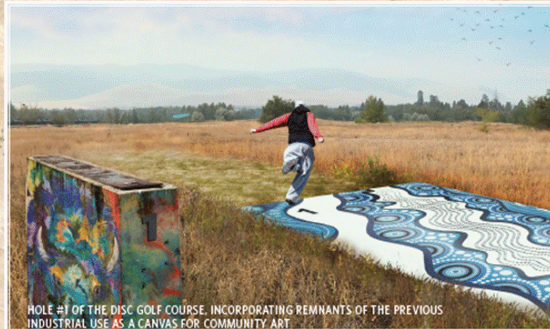
HOLE #1 OF THE DISC GOLF COURSE, INCORPORATING REMNANTS OF THE PREVIOUS INDUSTRIAL USE AS A CANVAS FOR COMMUNITY ART

Utilizing an iterative design process that incorporated a visioning session, site tour, and interviews/feedback from Confederated Salish and Kootenai Tribe (CSKT) community members and key stakeholders, a Conceptual Reuse Plan was established for the Flathead Post & Pole site. This plan includes initial steps to clean up/remove debris from the site, restore habitat, and establish a community arts and cultural program. Follow-on phases include the design and construction of a variety of physical improvements designed to provide amenities for CSKT tribal members and to help activate the site. These features are identified on the following pages.