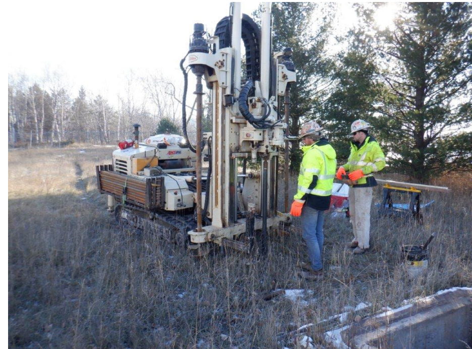
Cleanup in Wisconsin Point, Fond du Lac Band