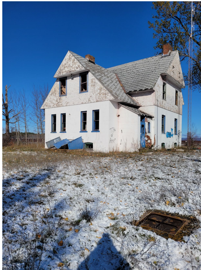
Cleanup in Wisconsin Point, Fond du Lac Band