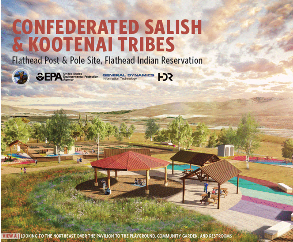
VIEW A | LOOKING TO THE NORTHEAST OVER THE PAVILION TO THE PLAYGROUND, COMMUNITY GARDEN, AND RESTROOMS