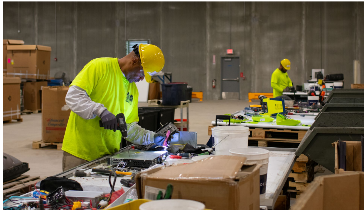
Dismantling electronics for recycling in the Recycle Force facility in Indianapolis, IN

These grants provide funding to recruit, train, and place unemployed and under-employed residents of communities adversely impacted by the presence of brownfield sites